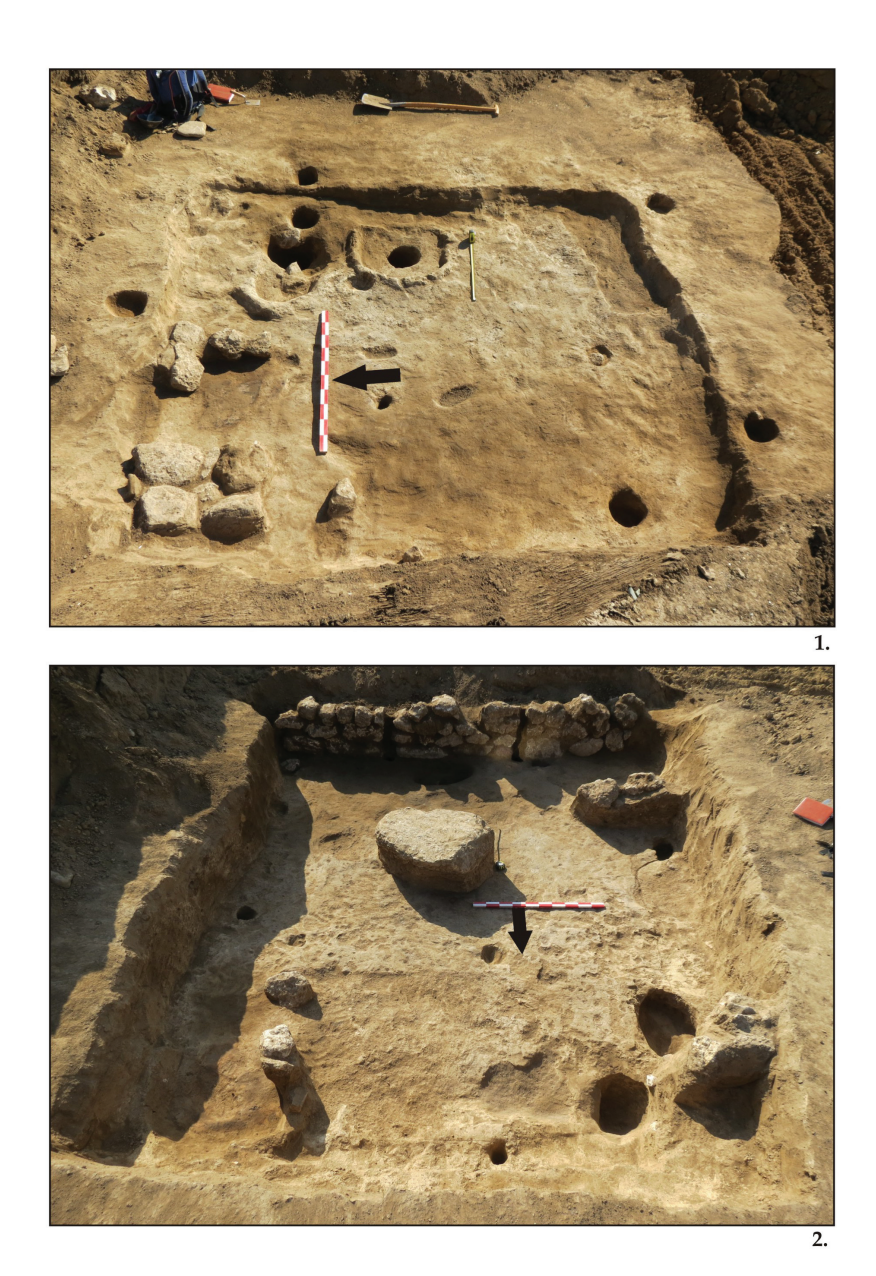
Plate 2. Sunken dwellings discovered in the early medieval settlement of Constanța -1. Complex 6; 2. Complex 7.