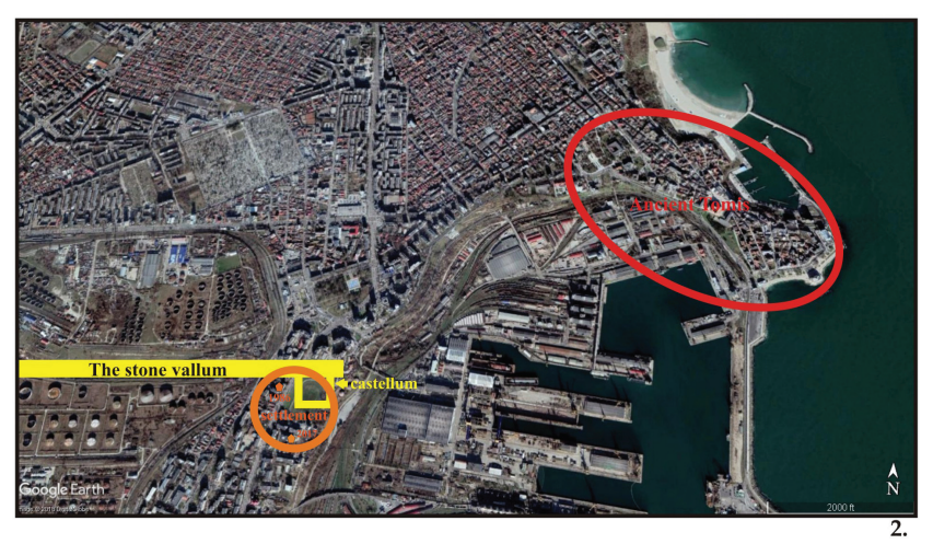
Plate 1. 1. The administrative position of Constanța (Constanța County, Romania); 2. The location of ancient Tomis and an early medieval settlement as well as its two excavated spots (in 1986 and 2017) in the plan of the city Constanța.