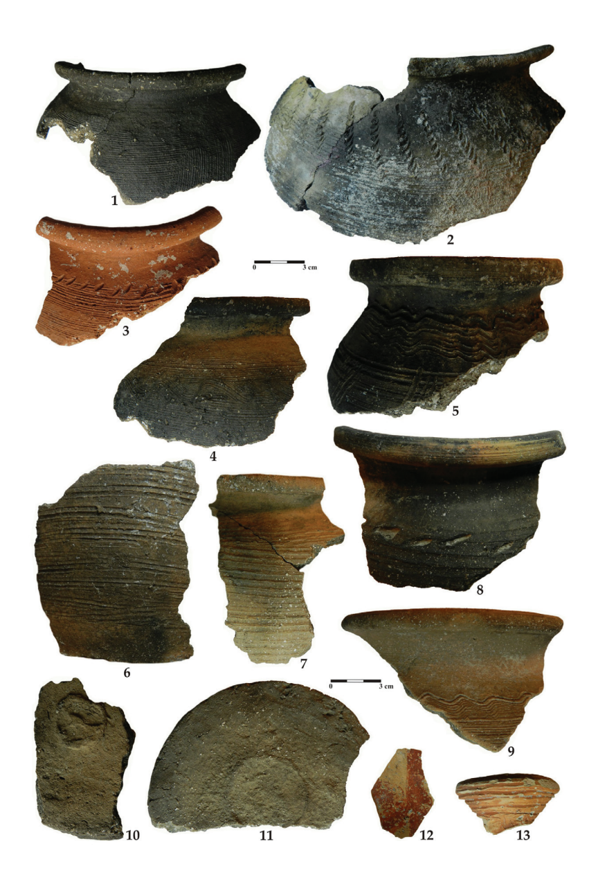
Plate 3. Pottery discovered in the early medieval settlement of Constanța. Tabuľka 3. Keramika objavená na včasnostredovekom sídlisku v Konstanci.